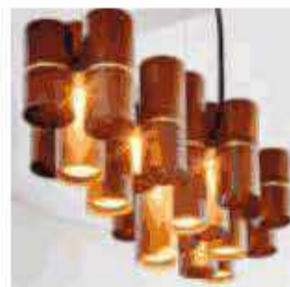
Conway Atkins House