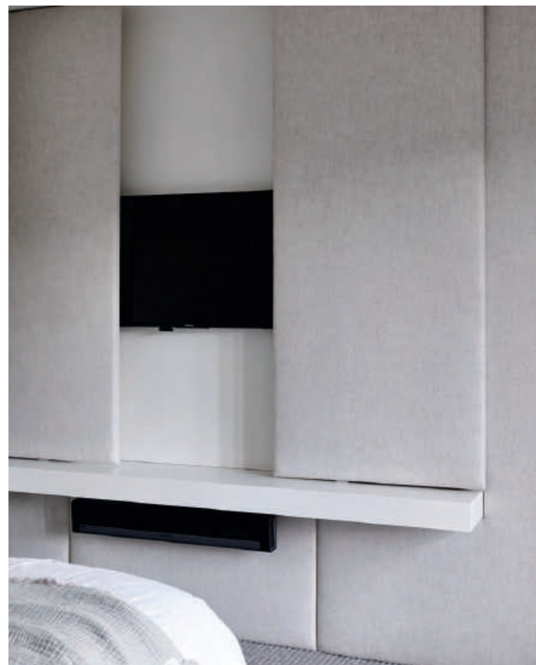
Paint colours are reproduced as accurately as printing processes allow.