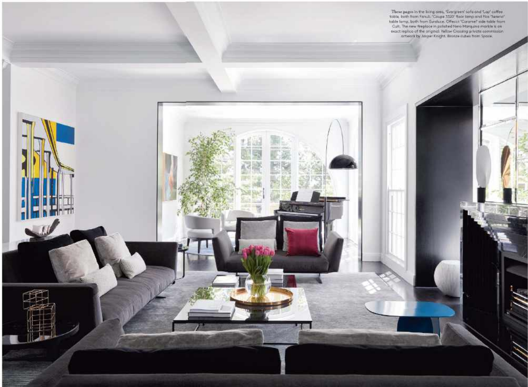
These pages in the living area, 'Evergreen' sofa and 'Lay' coffee table, both from Fanuli; 'Giuseppe 333D' floor lamp and 'Hoe 'Sereni' table lamp, both from Eusebio; 'Object 'Corama' side table from Cult. The new fireplace in polished Nero Marquina marble is an exact replica of the original. Yellow Crossing private commission artwork by Jasper Knight. Bronze cubes from Space.

Tucked underneath the central staircase is a sleek new powder room that, with its "experiential moodiness", wouldn't look out of place at a nightclub. Wrapped in 'Noir Mineral' wallpaper from Seneca, the mirrored grey ceiling tricks the eye, a pair of Tom Dixon 'Plane' golden disc